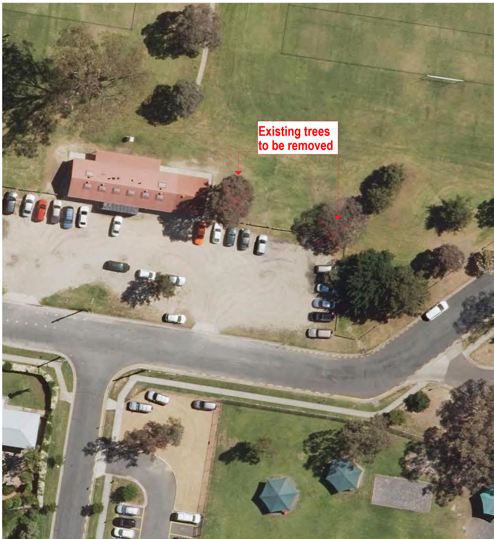
DEMOLITION PLAN 1:500