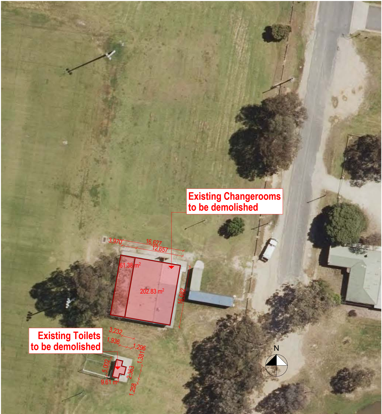
DEMOLITION PLAN 1:500